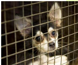
Puppy Mill dog

Hundreds of thousands of dogs are raised in commercial kennels every year. The majority of commercial kennels treat their animals humanely and within the law. However, there are some kennels, commonly known as Puppy Mills, that do not follow the law and do not treat their animals humanely, but instead, as a commodity. Puppy Mills are distinguished by the inhumane conditions of the kennels and the over breeding of unhealthy and genetically defective dogs. Lancaster, Pennsylvania has the distinction of being known as the "Puppy Mill Capital of the United States" due to the number of Puppy Mills located in this area. However, there