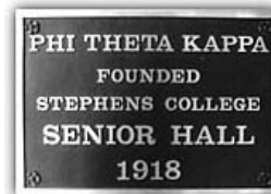
Phi Theta Kappa plaque at Stephens College

degree or certification and had to stop their educational goals due to an "obstacle or barrier." Some of the examples that were provided were the devastating floods from hurricanes, the destruction caused by tornadoes, or the rampant fires due to extreme arid conditions. This is a great scholarship and one that fills a need within our organization. Keep watch for any fundraising notices!